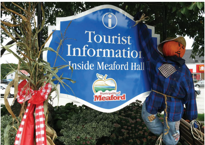
Adapted from information at www.meaford.ca

21 Trowbridge St. W Meaford, ON N4L 1A1 519-538-1060 www.meaford.ca