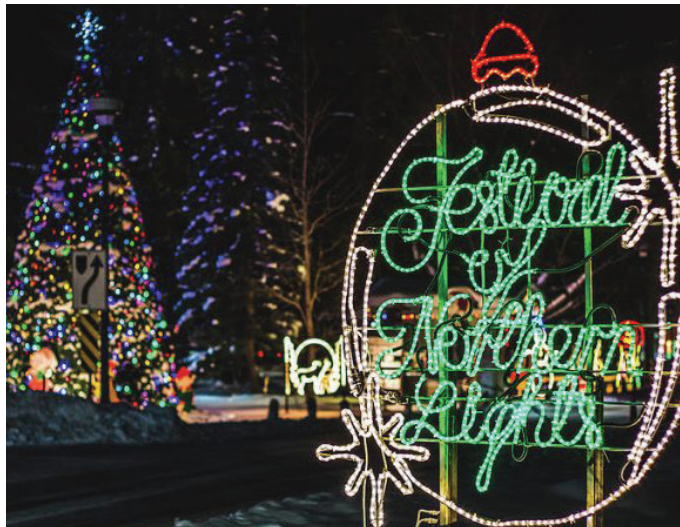
Adapted from information at www.owensound.ca

The City operates two arenas, numerous soccer and baseball complexes and is served by a modern recreation centre with pools, fitness facilities and more.