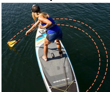
Cross Bow Stroke

For more information on paddling and SUP basics click here.